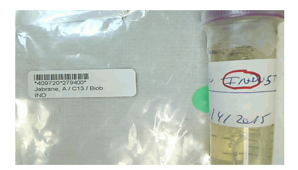
Package received -labeling COC