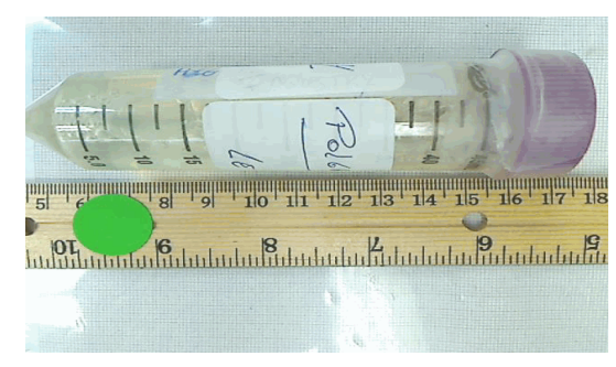
View of content (1mm x 1mm scale)